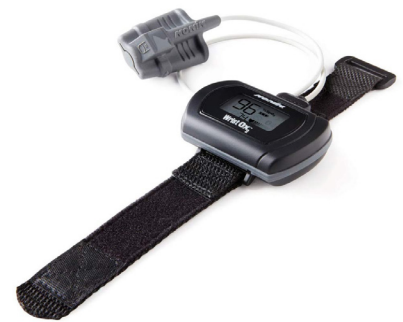
Nonin® Wrist Ox2 3150 pulse oximeter for SpO2 integration