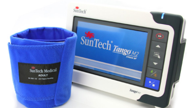
Suntech Tango® blood pressure monitor allows to integrate several parameters, including SpO2

Multiple printout report formats (single lead, all leads, full disclosure, sum up, trends, QRS, etc.)